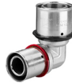
Reduced Elbow Female