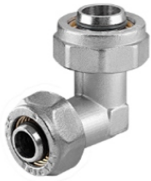
Reduced Elbow Double