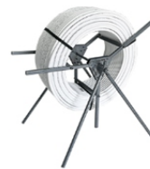
Pipe Decoiler (vertical and horizontal)