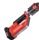
Electric Press Machine