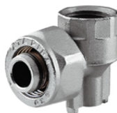
Wall Elbow Female With 2 Holes