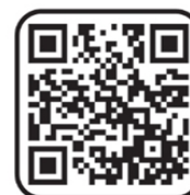
Main Catalogue Download