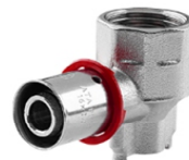
Wall Elbow Female With 2 Holes