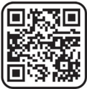
Atayar Web Application Download